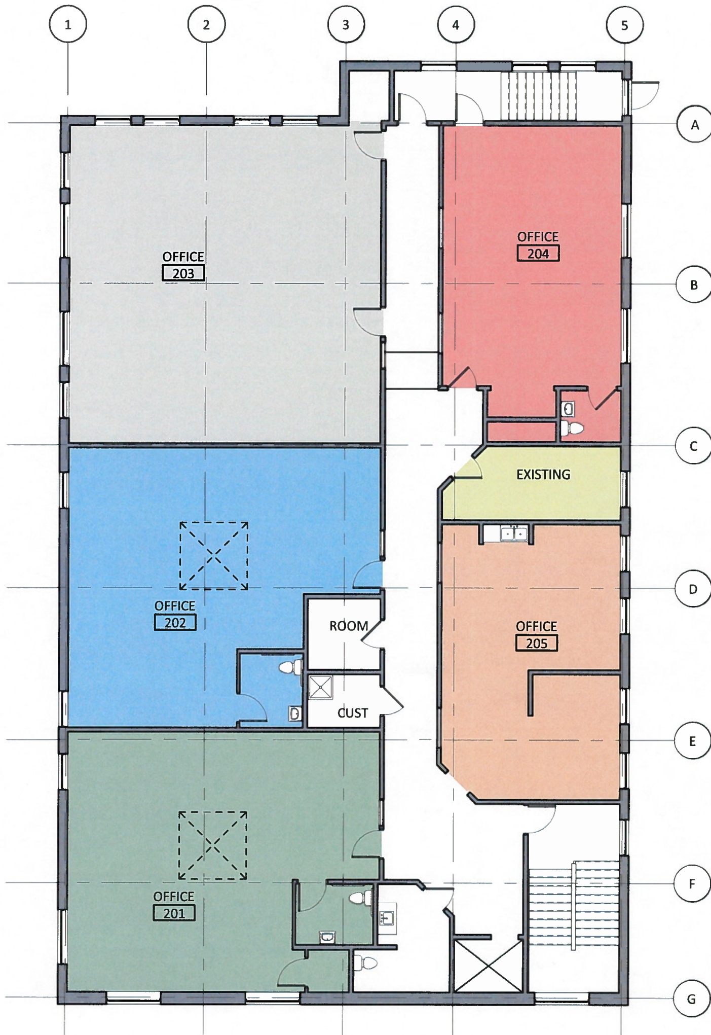
SECOND FLOOR OFFICE LAYOUT 11.30.2016 / scale: 3/32" = 1'-0" 1 BIANCHARD COURT