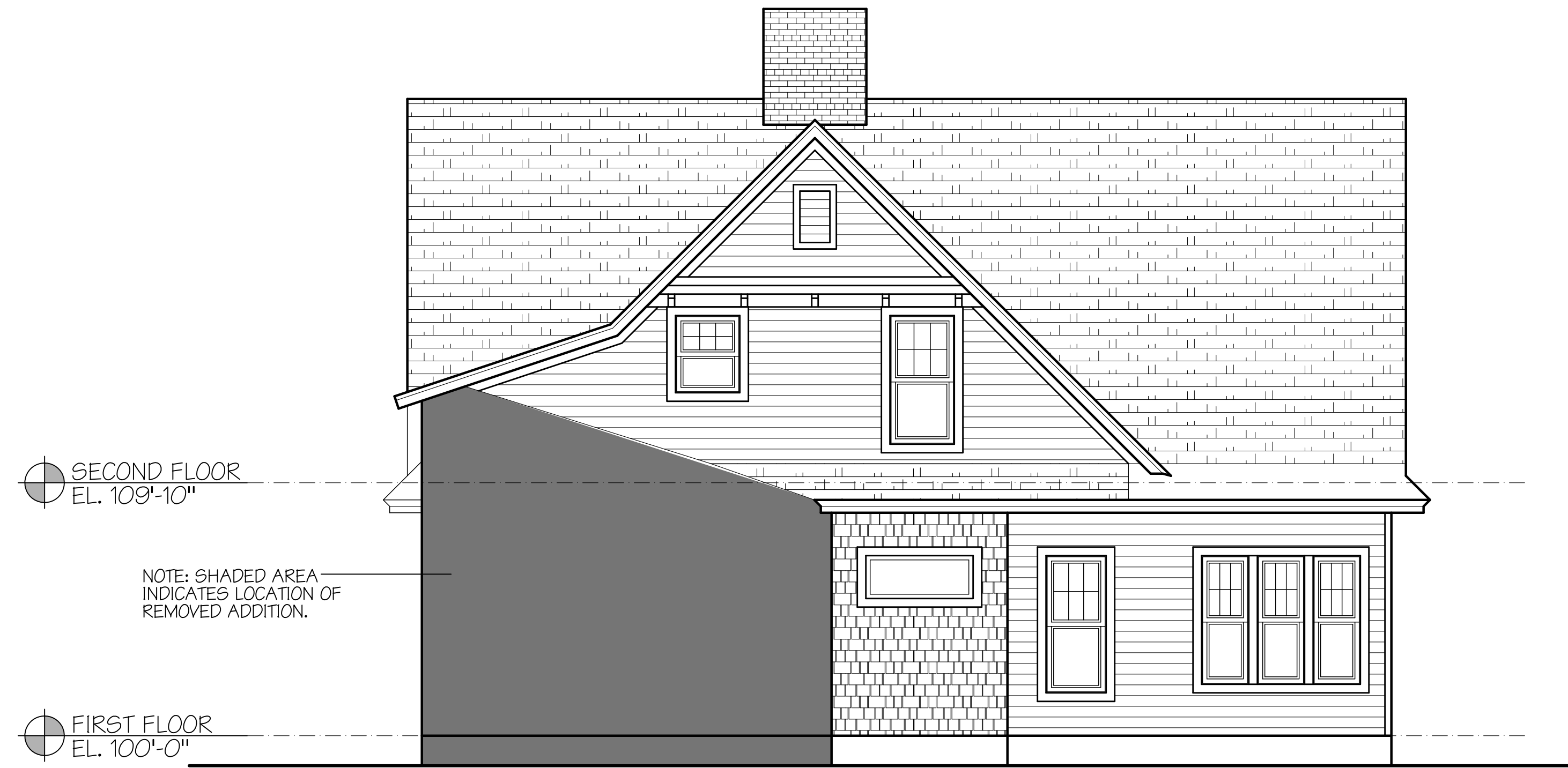
2 EAST ELEVATION SCALE: 1/4" = 1'-0"