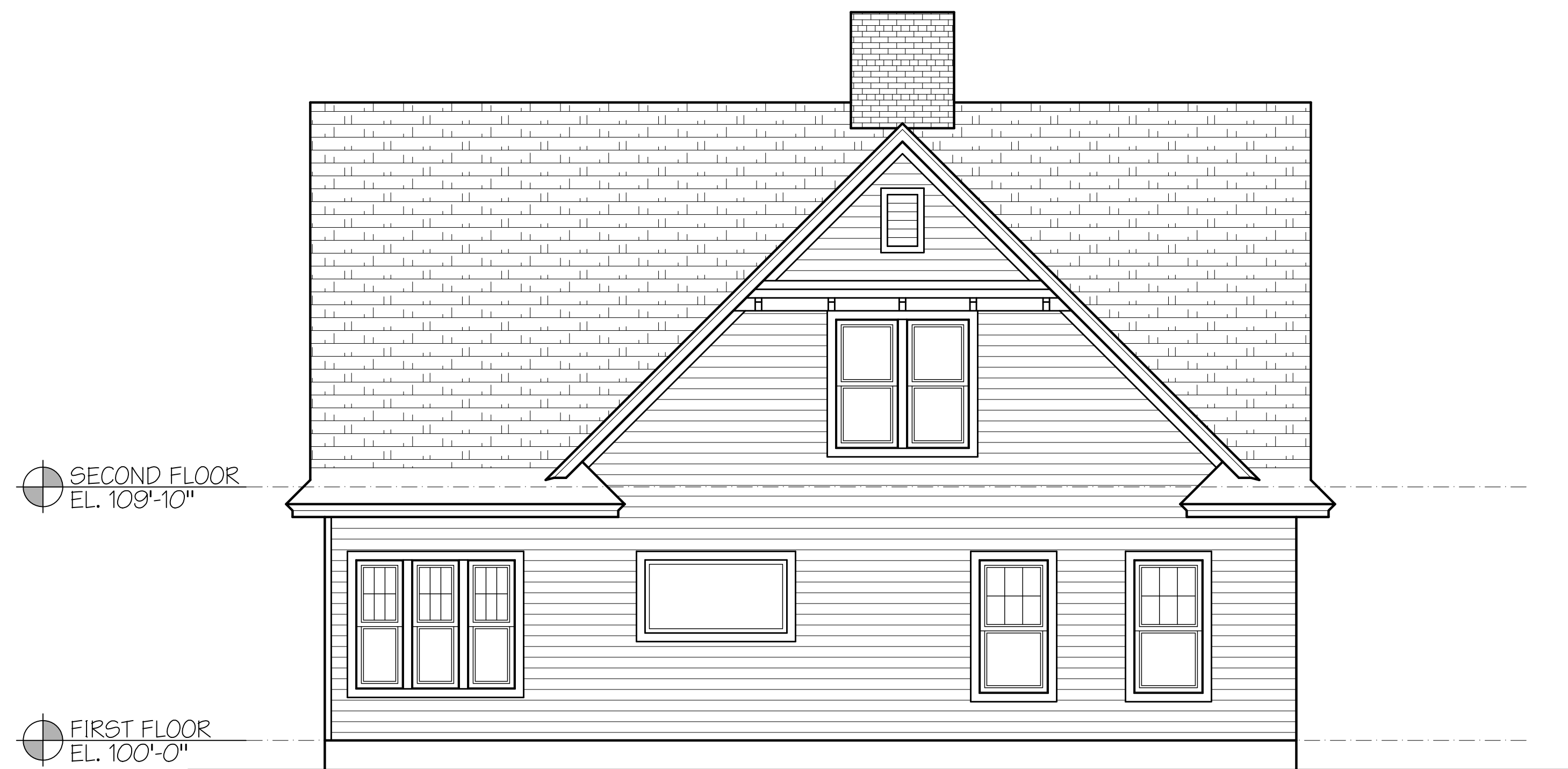
2 WEST ELEVATION SCALE: 1/4" = 1'-0"