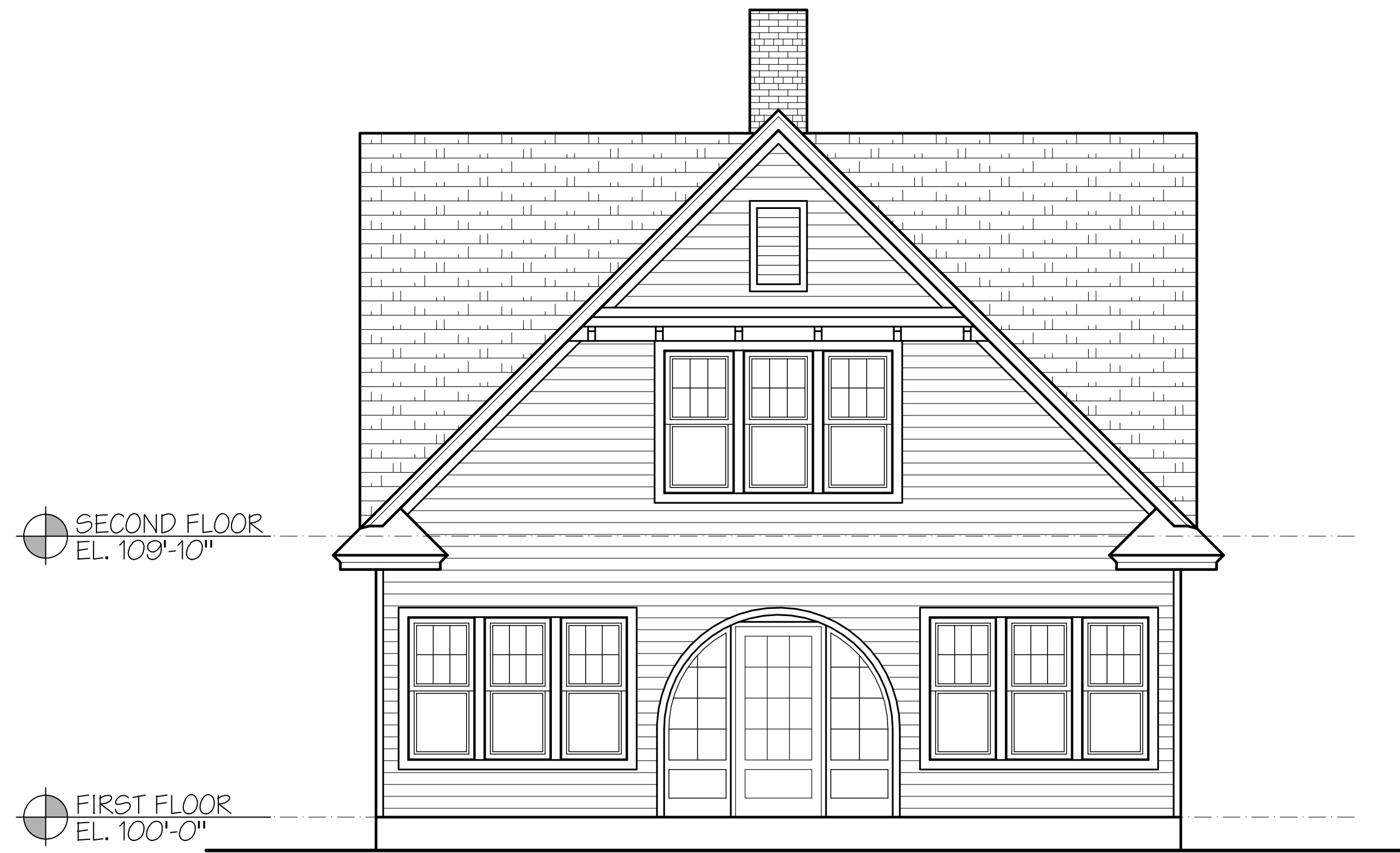
1 NORTH ELEVATION SCALE: 1/4" = 1'-0"